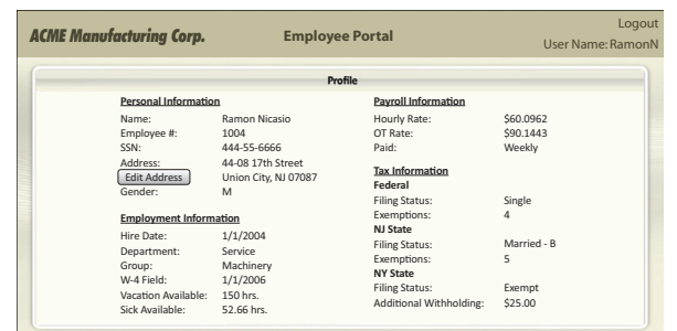
Employees can view and maintain their own payroll information securely and conveniently.

While we offer many benefits and a degree of personalized attention that you can't get from any service bureau, our payroll service is also highly competitively priced.